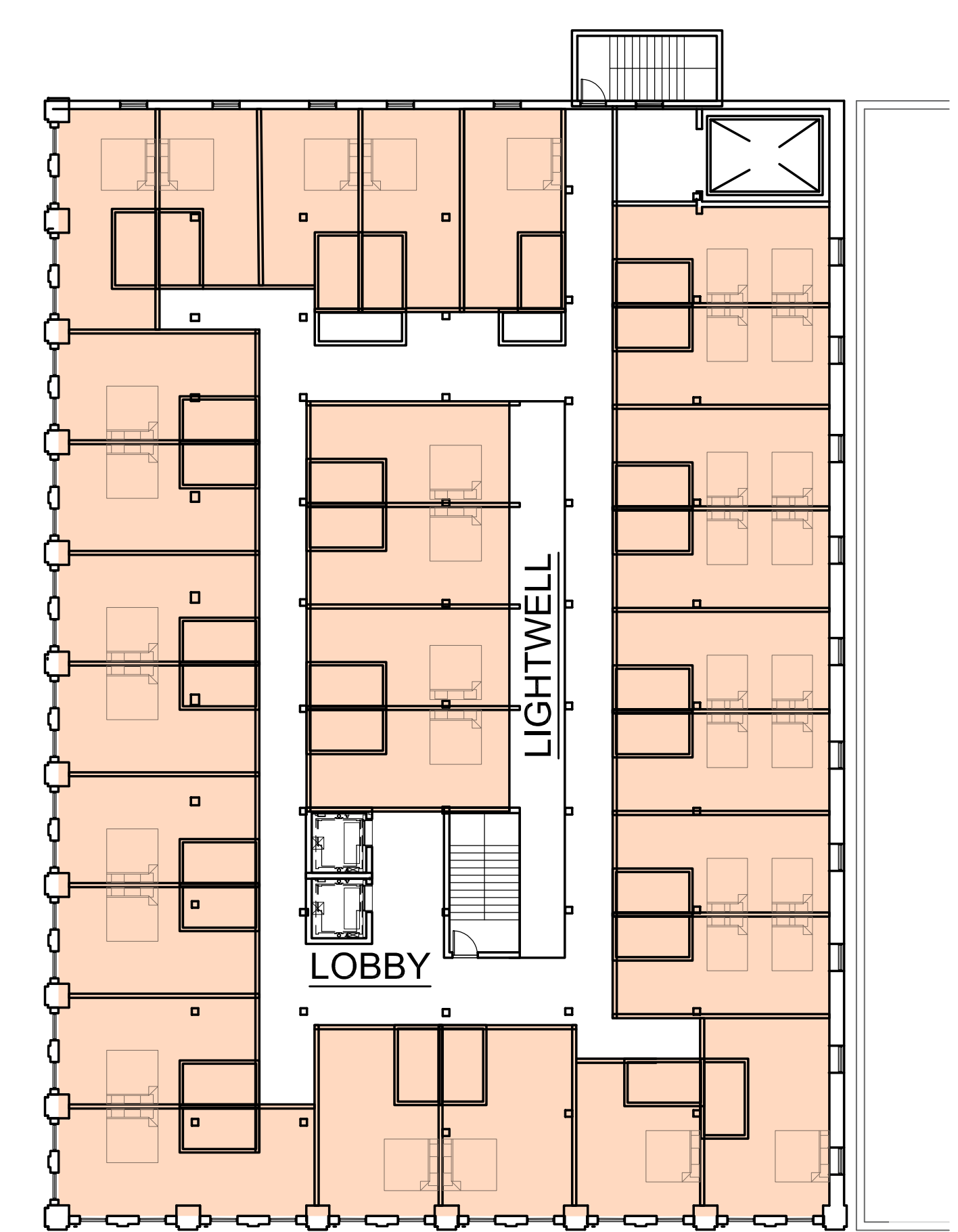
29 ROOMS PER FLOOR